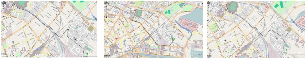
Figure 4: Results of route calculations for fixed start and target at different timestamps (from left to right: 7:00, 8:00, 8:30). Best viewed in color.

surements, i.e. the flow at a fixed sensor might change instantly if the sensor is located close to a factory at shift changeover.